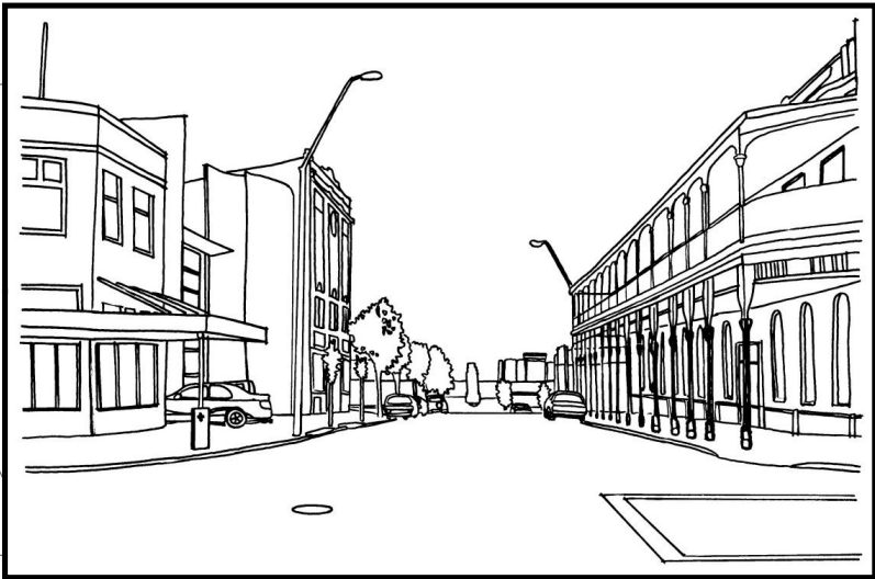
QUEEN ST VIEWSHAFT