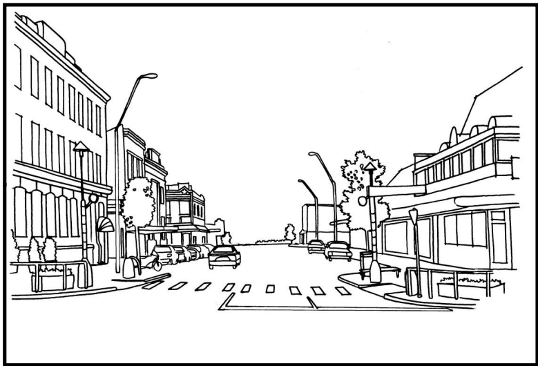
EGMONT ST VIEWSHAFT