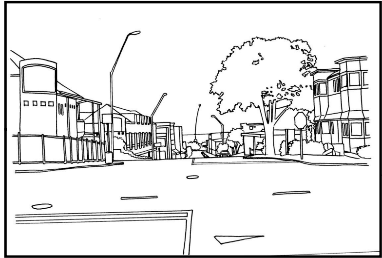
BROUGHAM ST VIEWSHAFT