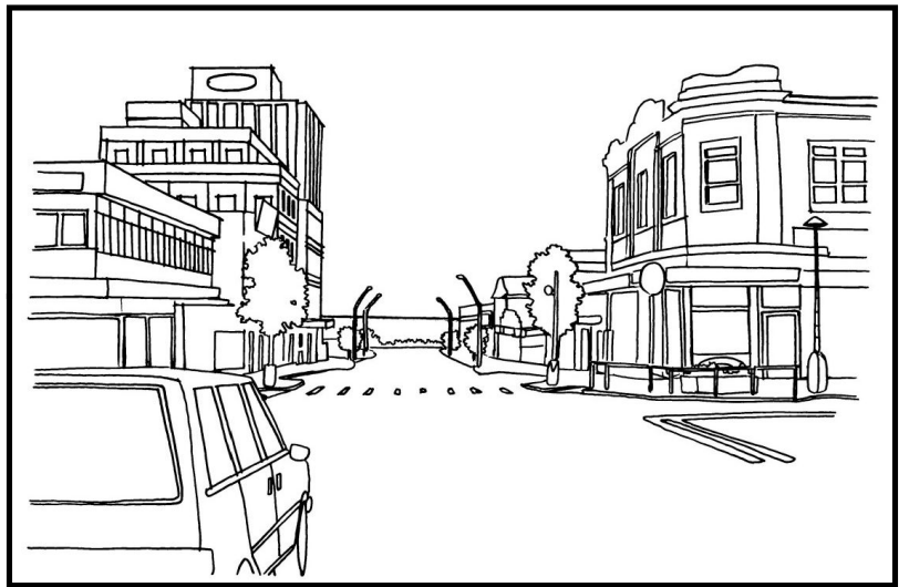
LIARDET ST VIEWSHAFT