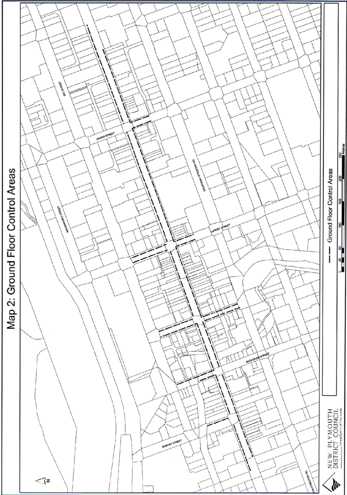
Map 2: Ground Floor Control Areas