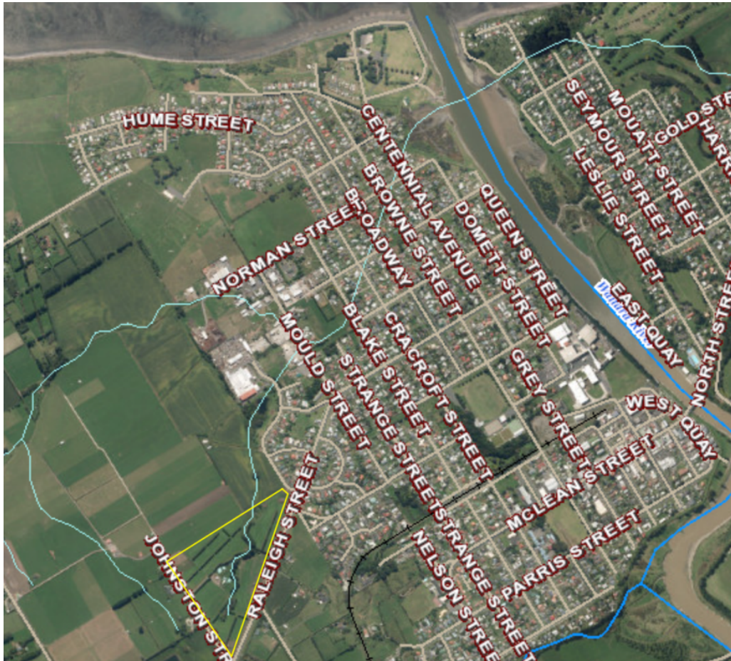
Figure 8. Site (yellow outline) in relation to waterways. (Source TRC GIS LocalMaps, October 2018)

There are anecdotal reports of mosquito fish being present in this pond (Otaraua Hapu, December 2018). After this pond the stream is open for a short stretch before entering a culvert that runs for about 1300m beneath the industrial/residential zone through to the Waitara River Scenic Reserve, which is identified as a Regionally Significant Wetland. This wetland is half Palustrine and half Estuarine. (source:TRC Local Maps 2019). There is a further wetland on the eastern side of the river at this point also (see figure 9 below).