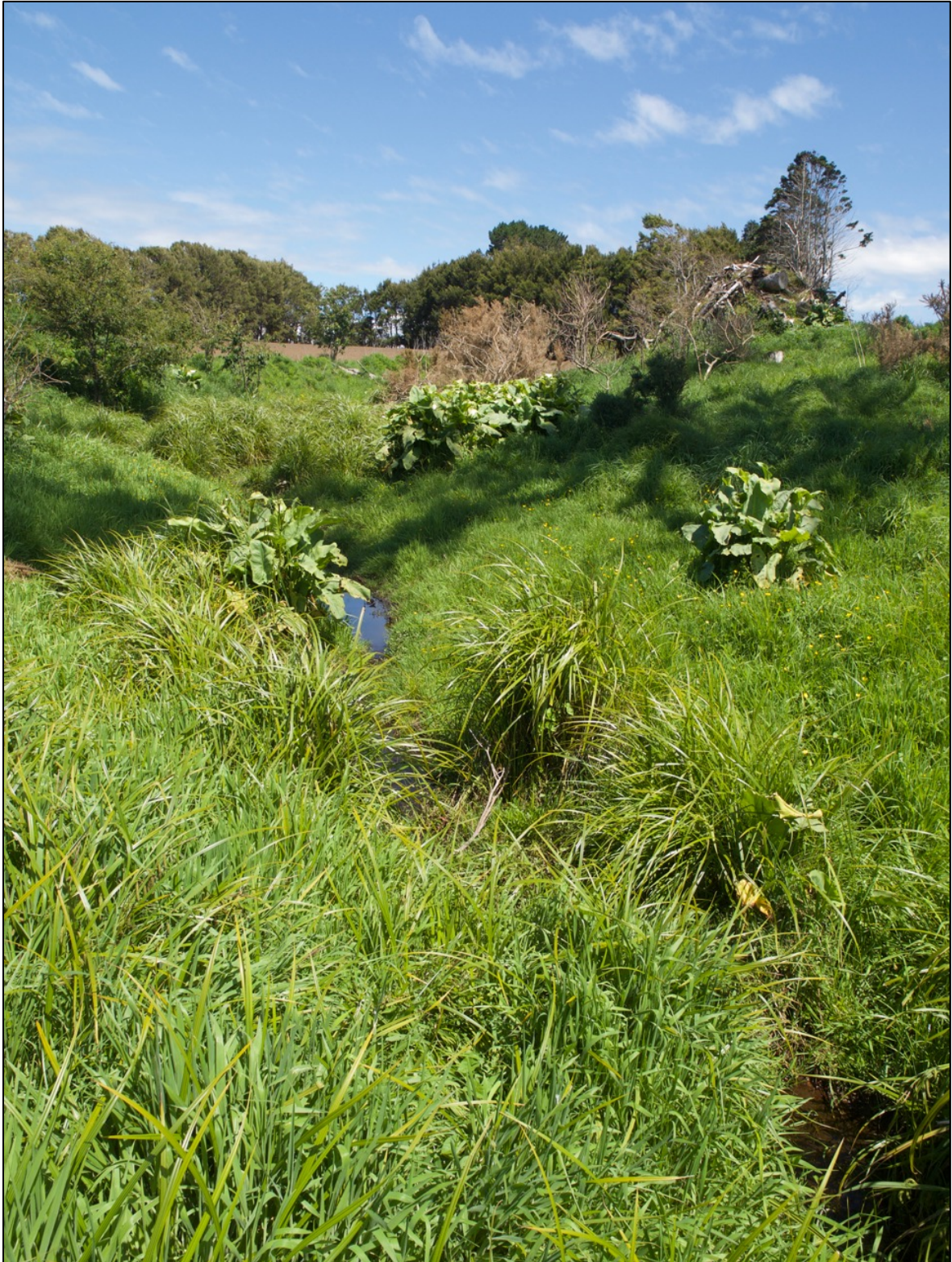
Figure 6: The small wetland at the northern end of the property, looking south. Note cultivated land in background where a young maize crop is sprouting