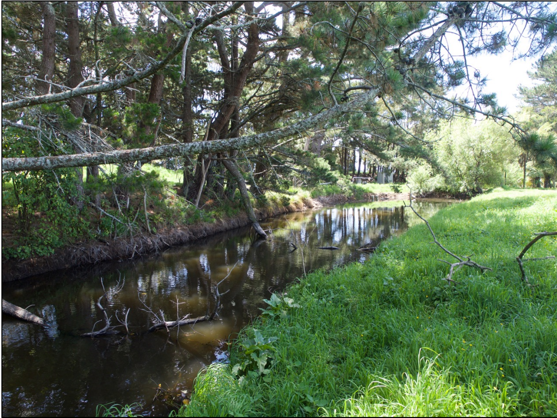
Figure 4: The man made pond within the unnamed tributary, with pine shelterbelt and rank grass riparian vegetation.