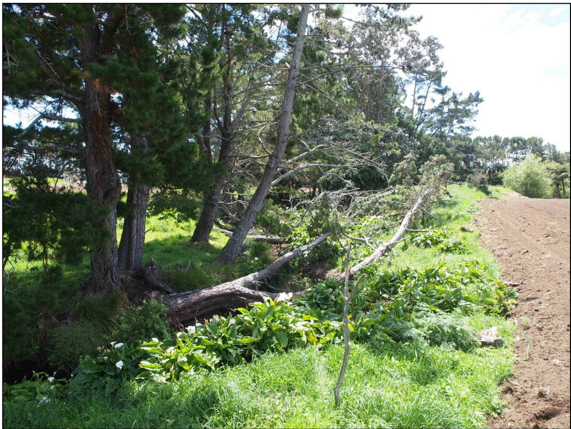
Figure 3: Pine shelterbelt and riparian vegetation alongside the unnamed tributary.