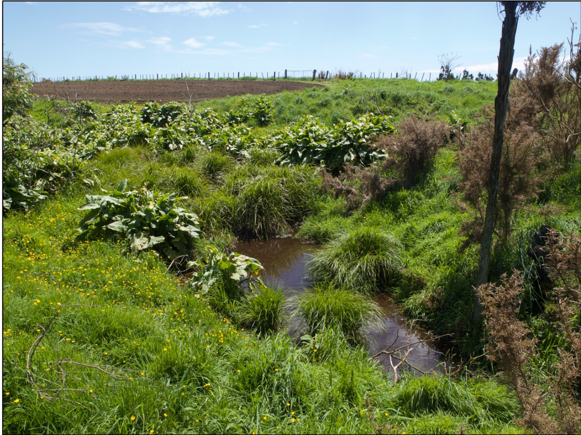
Figure 7: The small wetland at southern end of property dominated by the native sedge pūkiō.