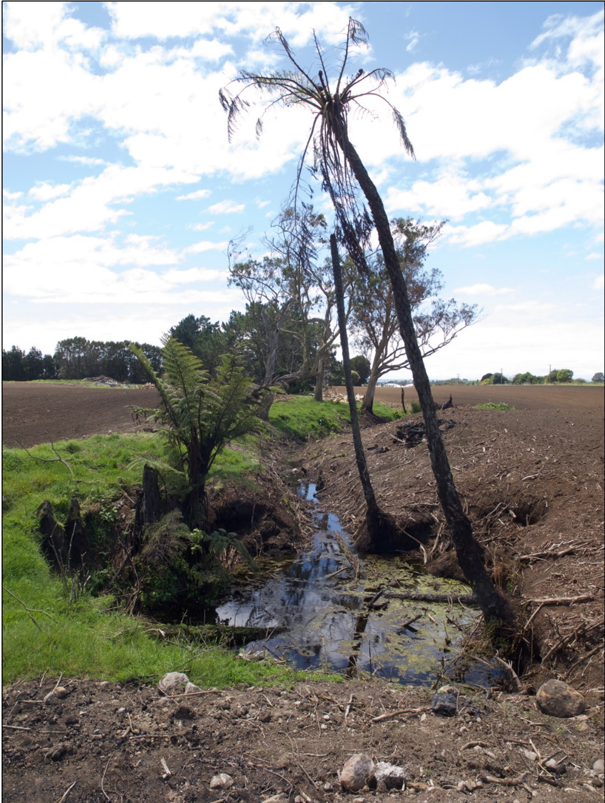
Figure 1: The small spring-fed pond at the top of the unnamed tributary at the southern end of the property.

It is proposed to develop the property for residential use. This will involve subdivision of the land, and associated installation of services and roadways. The Structure Plan for the land provides for the area in and around the waterway as Open Space Environment Area, which will be cleared of weed species, and planted out in native species. A walkway will be installed within this open space area to provide recreational opportunities.