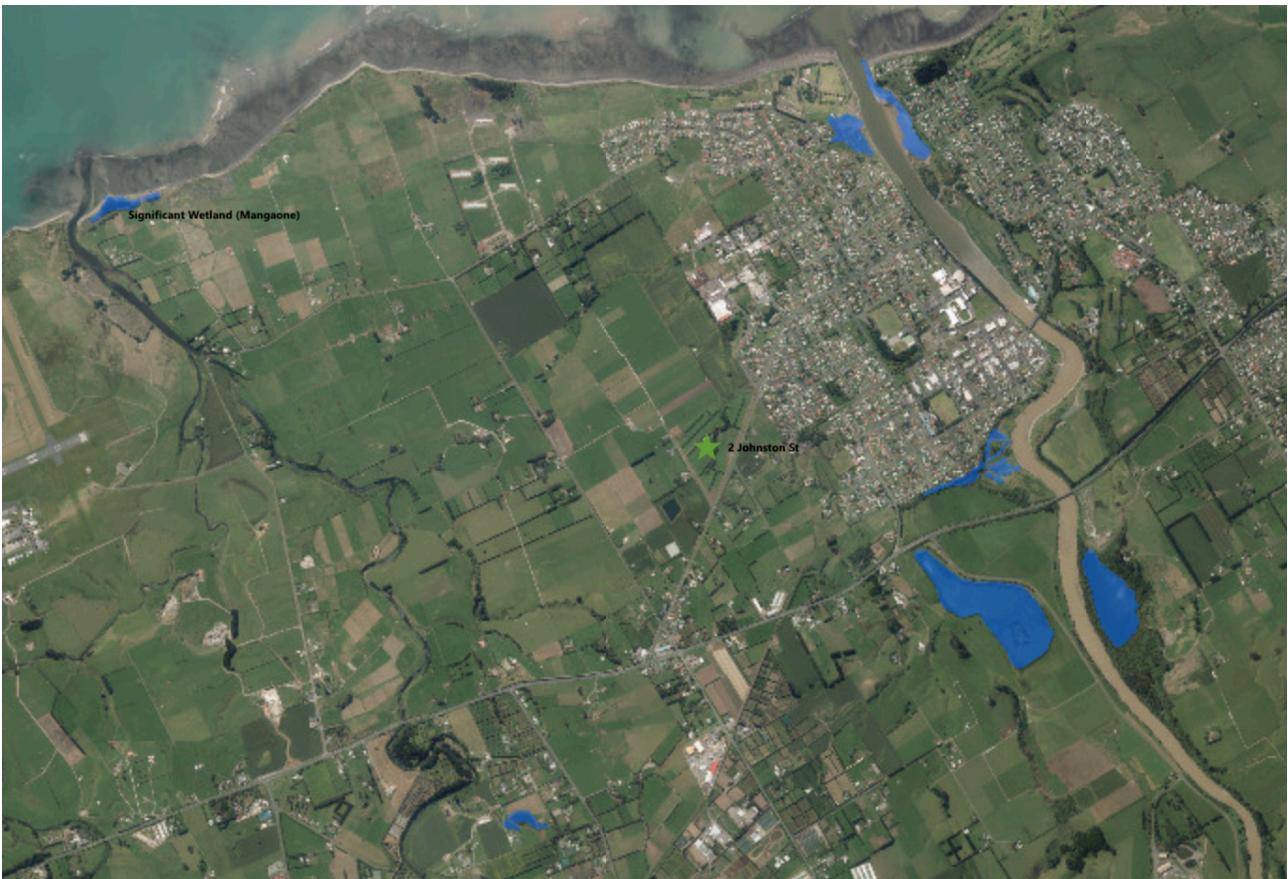
Figure 9. Site in relation to surrounding Key Native Ecosystems (Also Significant Wetlands) (Blue Areas)