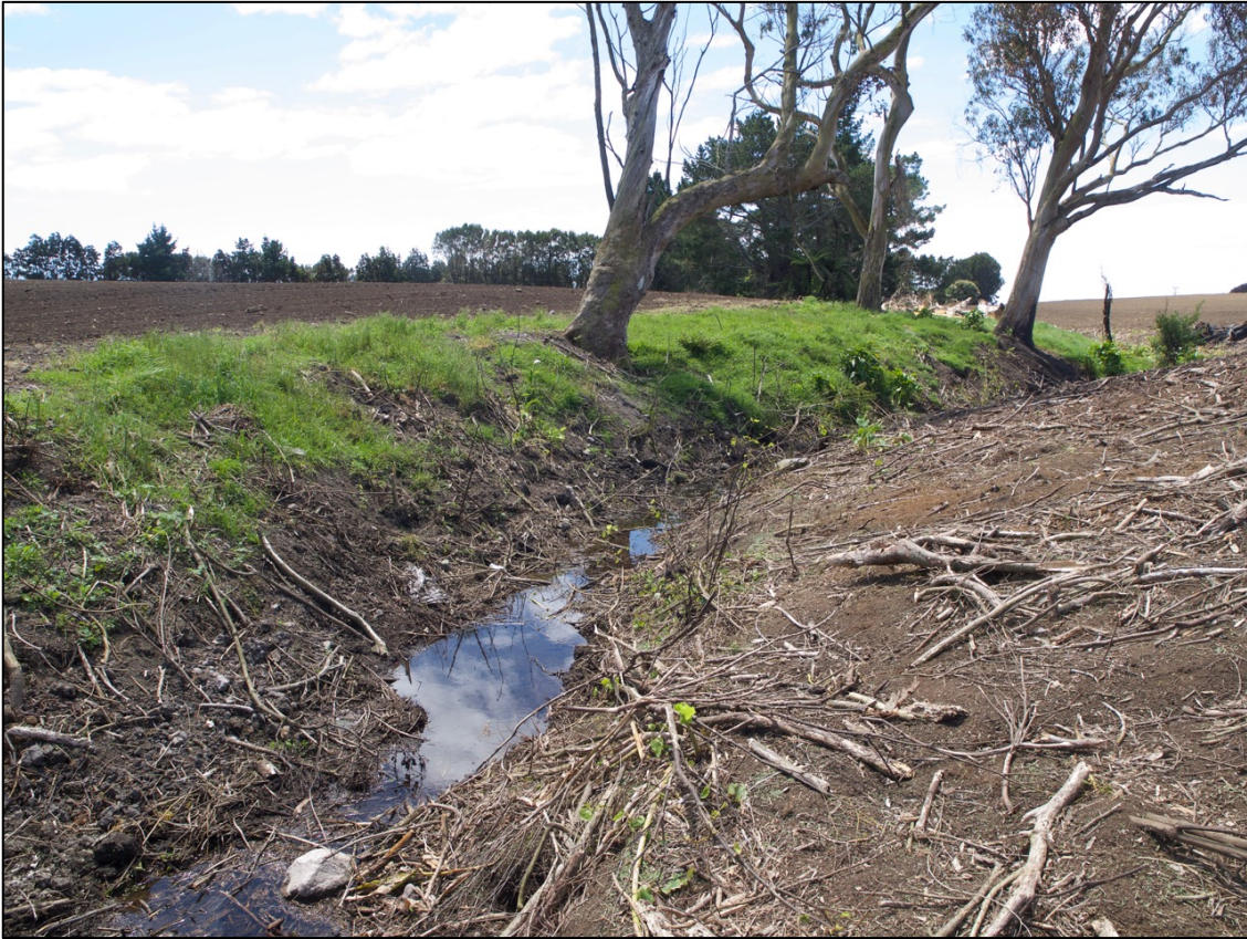
Figure 2: Cleared section of unnamed tributary at the southern end of the property.