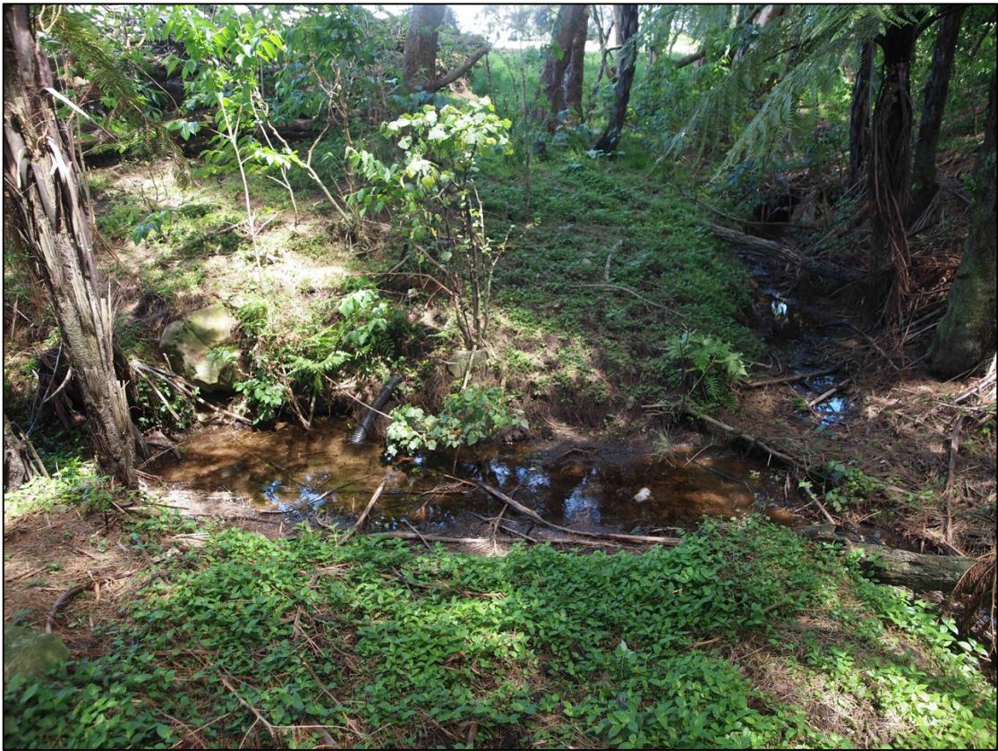
Figure 5: Tree ferns, and scrubby vegetation riparian vegetation under shelterbelt alongside the unnamed tributary.